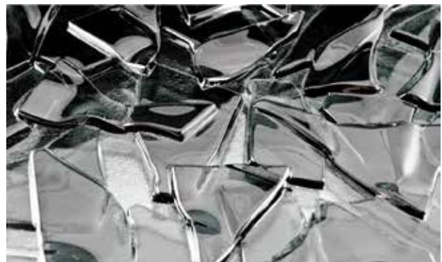
CRACKLE GLASS - BLACK