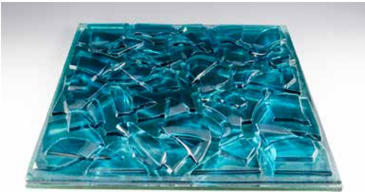
CRACKLE GLASS - AQUA BLUE